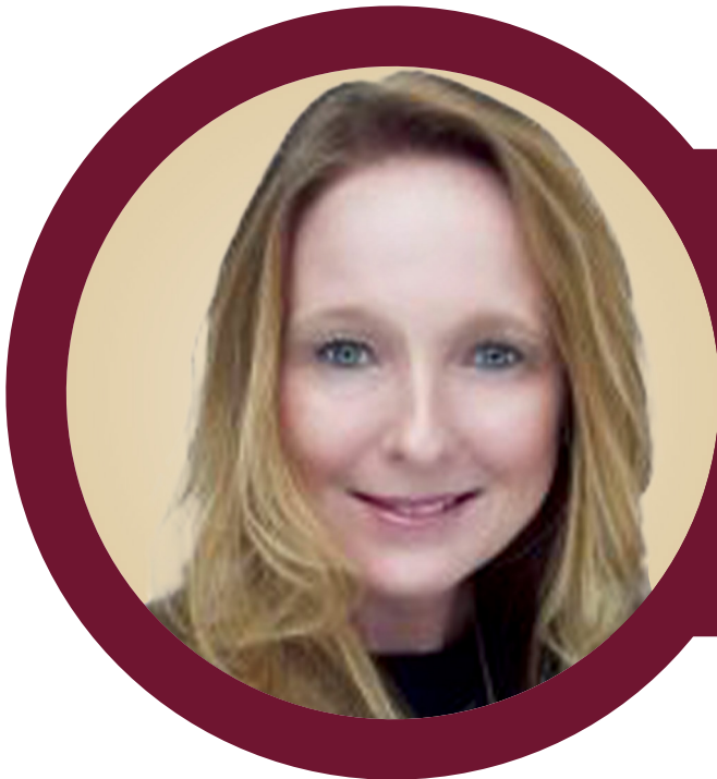
HOLLY SPRING SMARTBANK