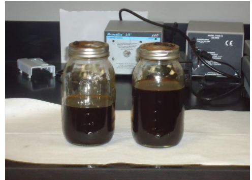
Figure: Bio-oil / Condensate Yield from Wood Chips