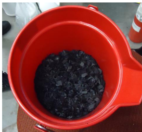
Figure: Char Yield from Wood Chips