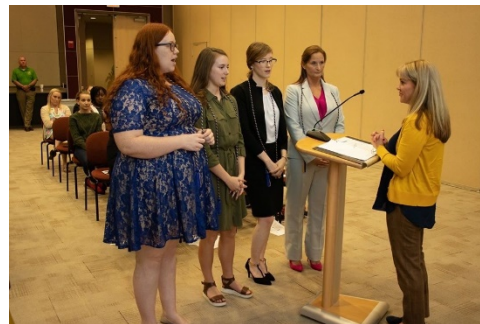
Officers Take the Oath